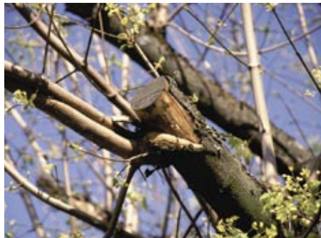
Fig: Lack of Nutrition. The area surrounding the point of topping will be starved of nutrition and will die (=starvation point). Decay can enter the tree.

Topping trees destroys the natural equilibrium of the tree. Complicated maintenance action will then be required. The subsequent costs for the owner of the tree will be considerable.