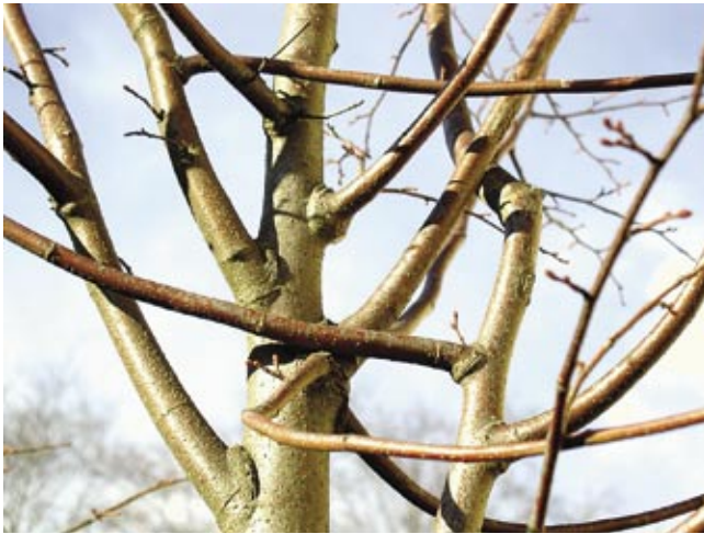
Crossing and rubbing branches: Professional pruning is essential

Professional crown pruning eliminates undesirable development, such as rubbing branches and optimises the development of the tree. There is an imminent danger that the removal of limbs could result in the permeation of fungus into the wound where the tree was topped causing permanent damage to the tree.