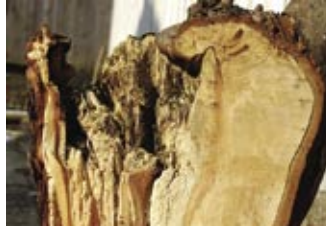
Fig. above: Fungi enter the tree at the point of topping and cause disintegration of wood

A tree which has been topped will try to restore the equilibrium between root and crown by producing multiple shoots (shoots which grow vertically or in an upward direction), these