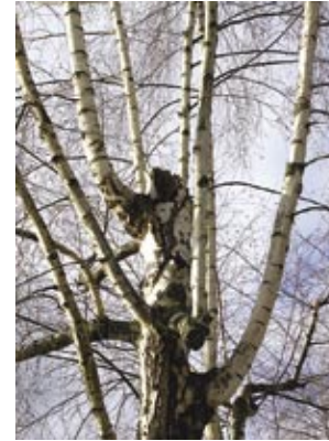
Fig. right: Formation of primary shoots following topping

shoots are usually unstable and will compete with each other. The continuous growth of the shoots and the process of decay pervading the wound caused by topping could easily cause the shoots to break off.